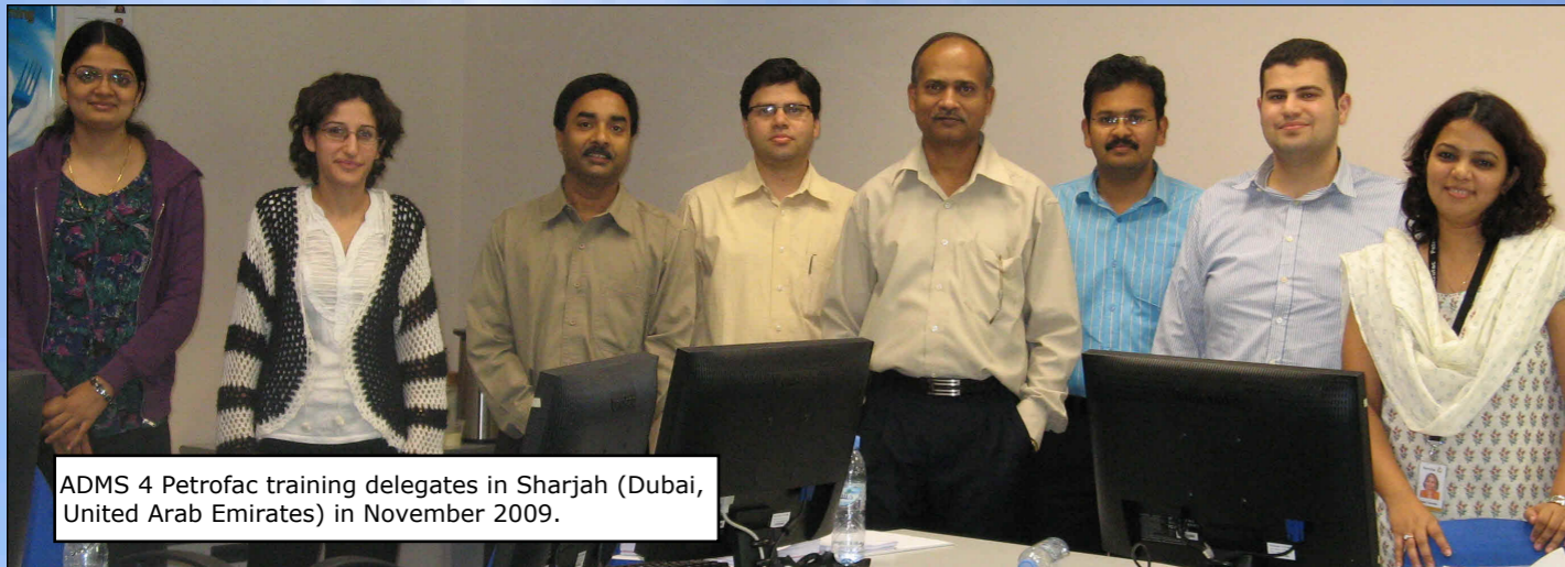
ADMS 4 Petrofac training delegates in Sharjah (Dubai, United Arab Emirates) in November 2009.

Our new website, launched in February 2010, describes CERC's software and services.